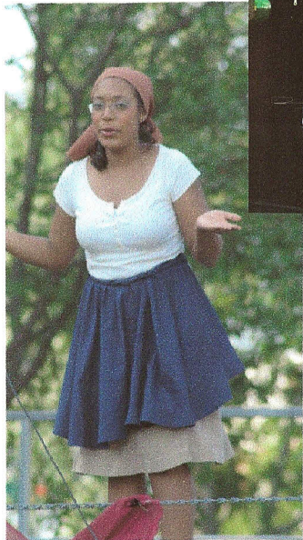
Seussical, Jr. Summer 2008

Alliance Theatre, Inc. 43 Beers Street New Haven, Ct 06511 (203) 435-4651 www.alliancechildrenstheatre.org