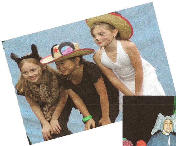
Cinderella Summer 2009